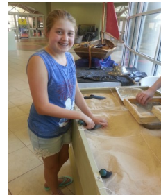
"Digging" the Archeology Table