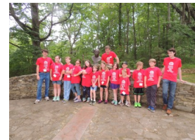
Field Trip to the Beulah Rucker Educational Center