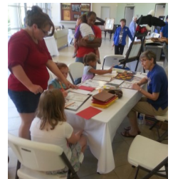
Making Explorer Journals