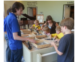
Hands on Fun at Family Day