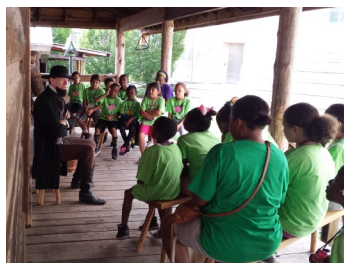
Questions for "Pa Ingalls"