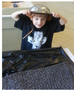
Trying on items from the DeSoto Expedition