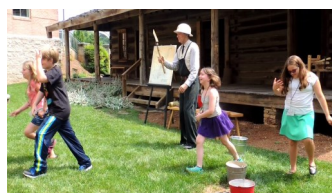
Civil Defense Drills