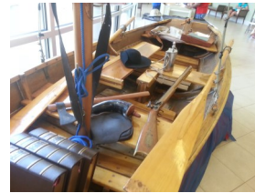
Bartram's Sailboat from 18th Century Georgia