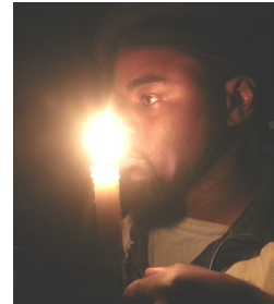
Haunted History Stories