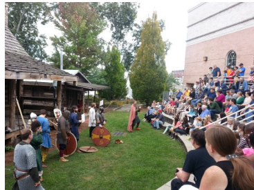
Family Day exhibition