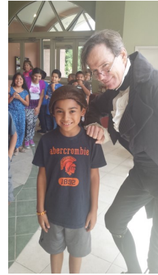
Student from Myers Elementary trying on "Patrick Henry's" wig!