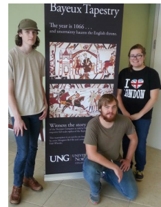
Much thanks to our interns!