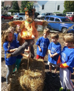
Children of Grace & their scarecrow